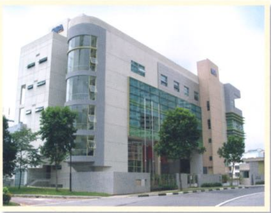
Senja Soka Centre 信佳创价会馆

特别的注意力放在维护日莲佛法的传统和修行的庄严与神圣性。这反映在纪念堂的设计美学和所举行的追思仪式上。